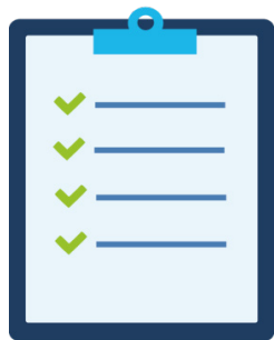
Collect on Paper